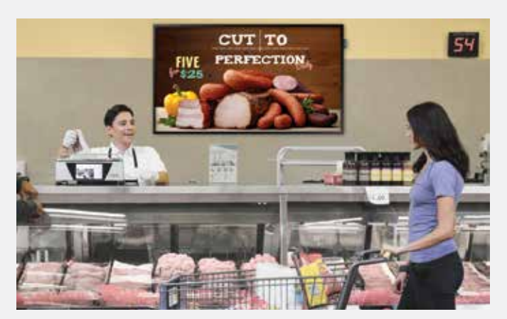
Figure 2. DBE Series enables instant message update and delivery

Samsung DBE Series SMART Signage provides high performance and cost-efficiency in a sleek and professional design. The displays' 350-nit brightness, reliable 16hours/7days operation and full-high definition (FHD) enable businesses to attract and engage audiences. A powerful quad-core processor and advanced, 3rd Generation Samsung SMART Signage Platform (SSSP) for embedded content management along with expanded 8GB storage capacity has replaced the previous 2nd Generation SSSP with Dual Core processor and 4GB memory storage to ensure robust business performance. DBE Series displays are easy to operate, install and maintain while consuming less power for economical use compared to the previous DBD Series. A wide range of sizes, and optional touch capability provides businesses with the flexibility to create and deliver a truly unique message on small signage.