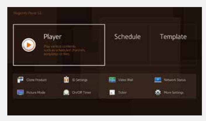
Figure 5. Simple and intuitive operation of MagicInfo S3