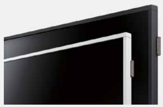
Figure 6. Various bezel options for polished and professional look

DBE Series Smart Signage enhance the display environment through their sleek, streamlined design, reflective of previous Samsung D Series SMART Signage for efficient compatibility. These stunning displays feature optional black hairline or white color slim deco-bezels to compliment the specific room decor. And, a flexible, tag-type spacer with a logo is designed for either portrait or landscape installations to create a polished, professional look in any space.