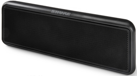
MXP-3B Wall Mount Conferencing Loudspeaker BLACK