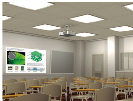
For academic use