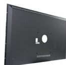
Back cover accessories