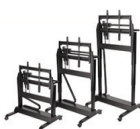
Electrical lift PT-LIFTHL-4075